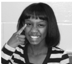
Attentive to My Surroundings