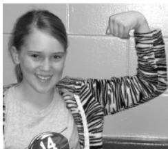
Stay Physically Fit and Maintain My Health