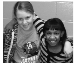
for My League of Girls's Sisterhood