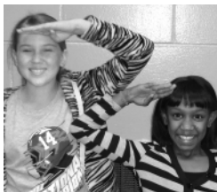
Extend the Hand of Acceptance and Respect to Others