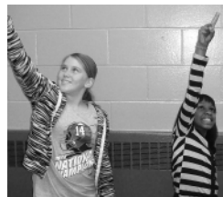
Make the World a Better Place